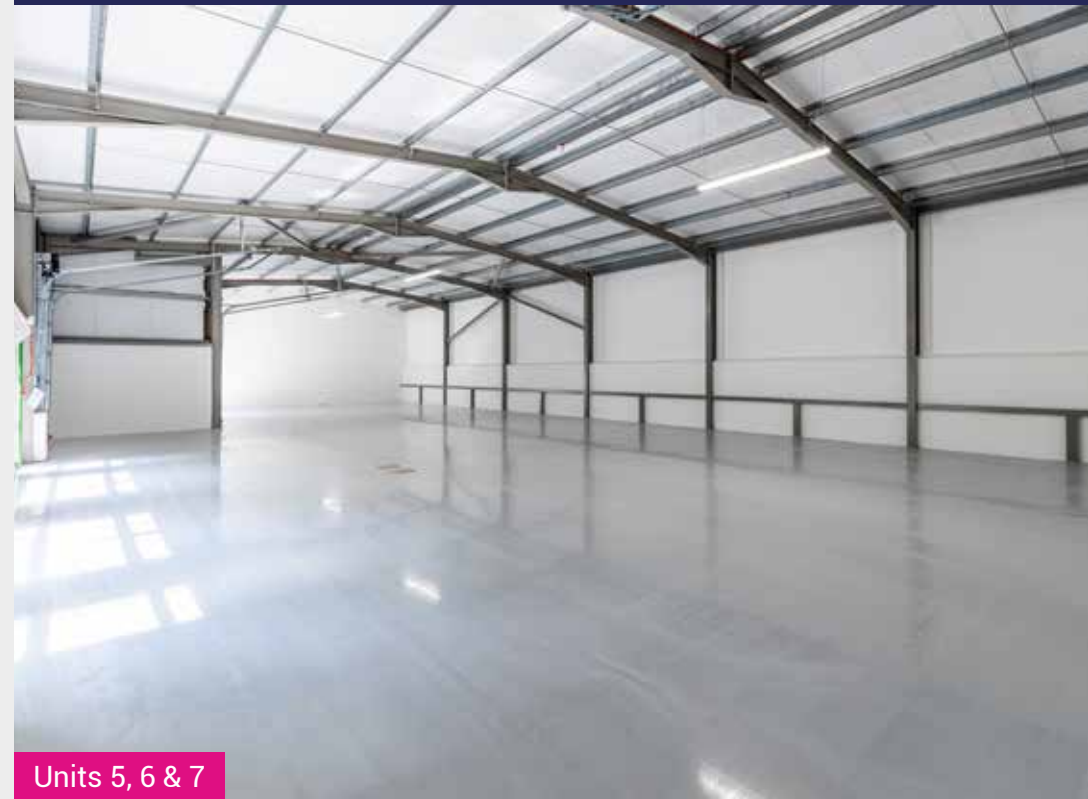
Units 5, 6 & 7

All the units (except unit 10) will each provide fully refurbished industrial accommodation with LED lighting throughout, insulated roller shutter doors and welfare facilities being provided.