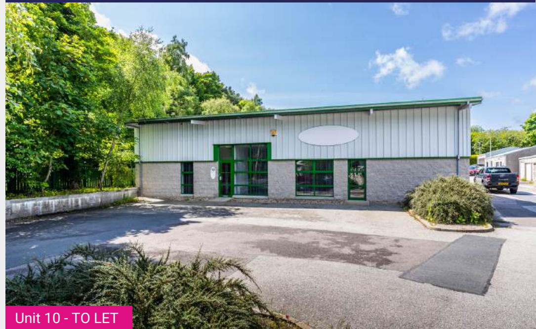
Unit 10 - TO LET

Unit 3 is currently fitted as a health and fitness studio with a small office and wc. Units 5 & 6 and Unit 7 offer versatile warehouse accommodation with integrated office space and WC facilities, ideal for a range of commercial occupiers. Unit 10 provides newly refurbished, modern office additionally benefits from approved leisure use, accommodation and offering excellent flexibility for occupiers.