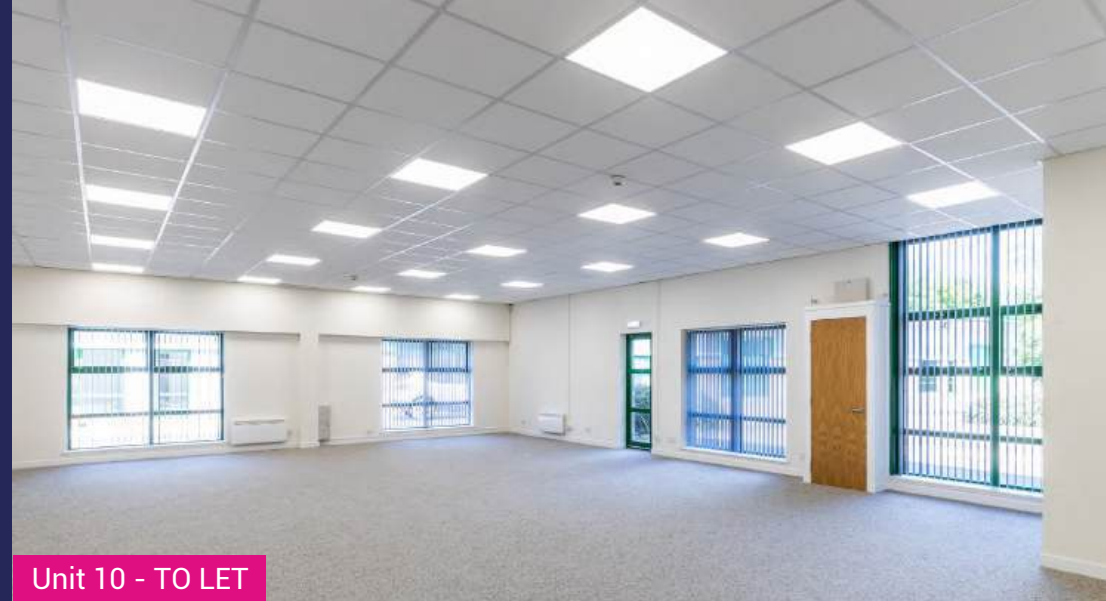
Unit 10 - TO LET

Unit 10 offers refurbished accommodation in a detached, prominent unit at the front of the Business Park. The internals of the unit provide open plan office space with carpeted floors, painted plasterboard walls, LED lighting and WC and tea prep facilities. The unit benefits from excellent natural lighting via large double glazed aluminium windows on two elevations. Unit 10 benefits from dual office and leisure use.