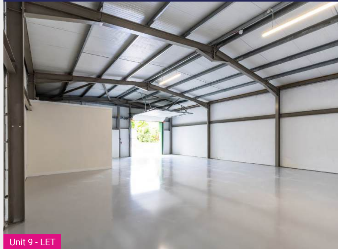
Unit 9 - LET

The available units (except unit 10) each provide fully refurbished industrial accommodation with LED lighting throughout, insulated roller shutter doors and welfare facilities being provided.