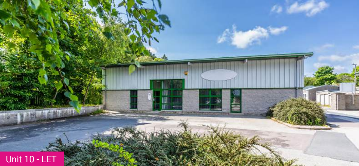
Unit 10 - LET