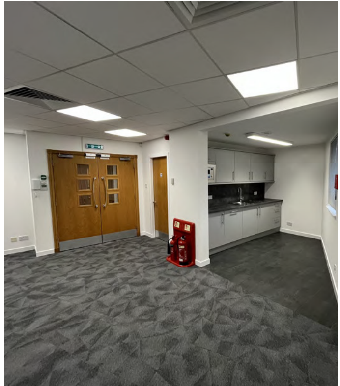
Suite A - Recently refurbished by Knight Property Group.

The subjects are located on St Swithin Row within Aberdeen's prestigious West End office district.