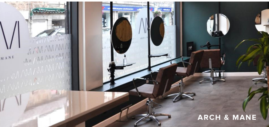
ARCH & MANE